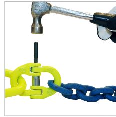
Assembly with C-lok