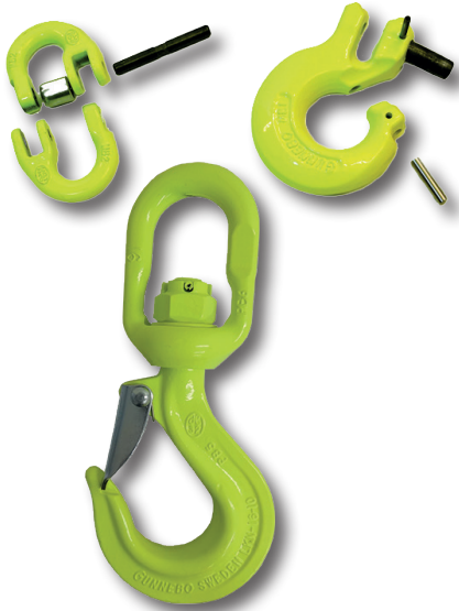
Assembly with G-link